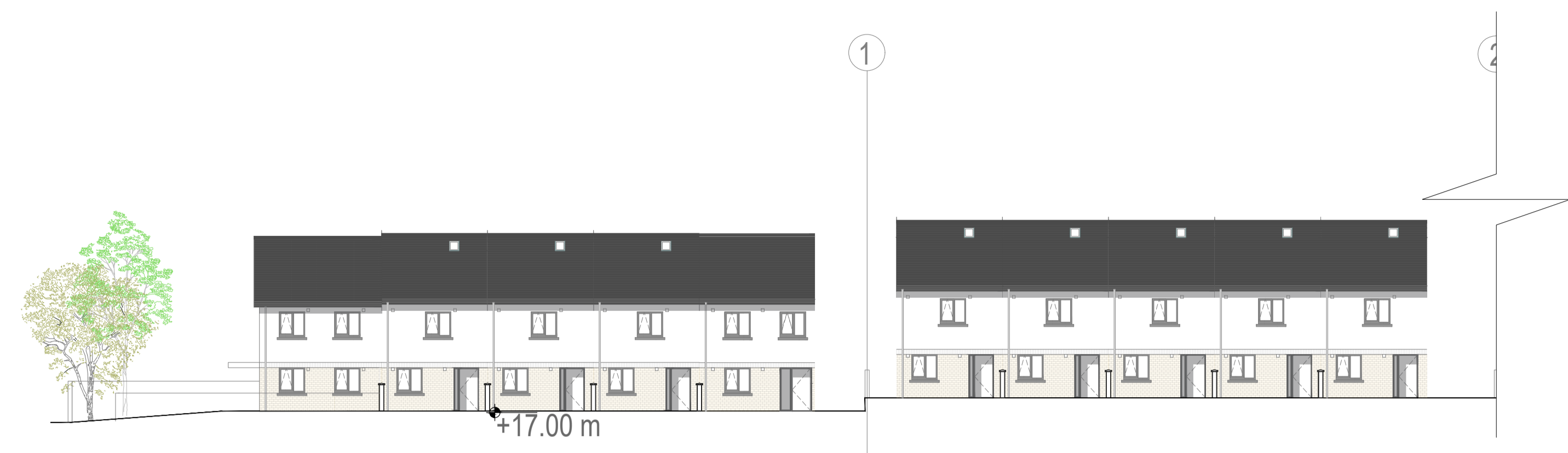
F-F ELEVATIONS- PART 1