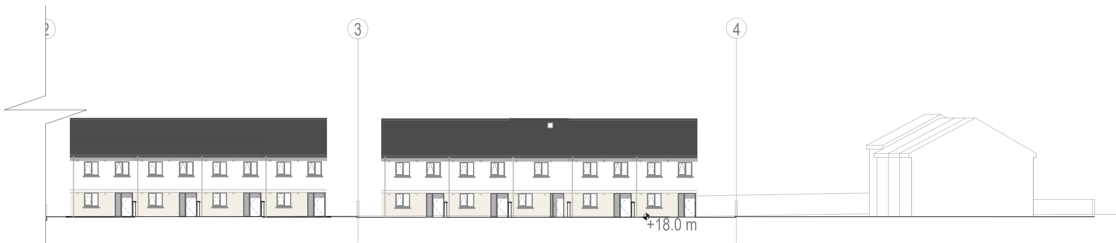
F-F ELEVATIONS- PART 2